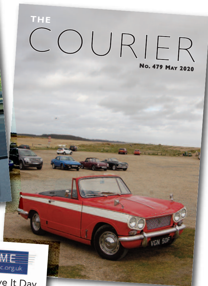
Norfolk Dunwich Run TSSC Courier cover May 2020